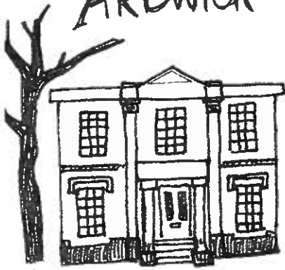
★ GASKELL HOUSE (A regency style villa)